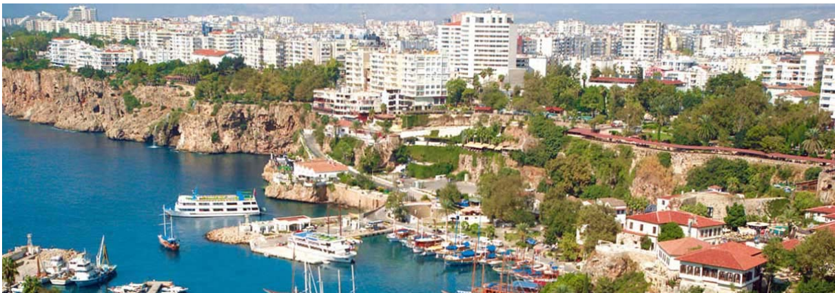
Figure 2. View of Antalya city.

Antalya is a city and Mediterranean Sea port in southwestern Turkey (Fig. 2).